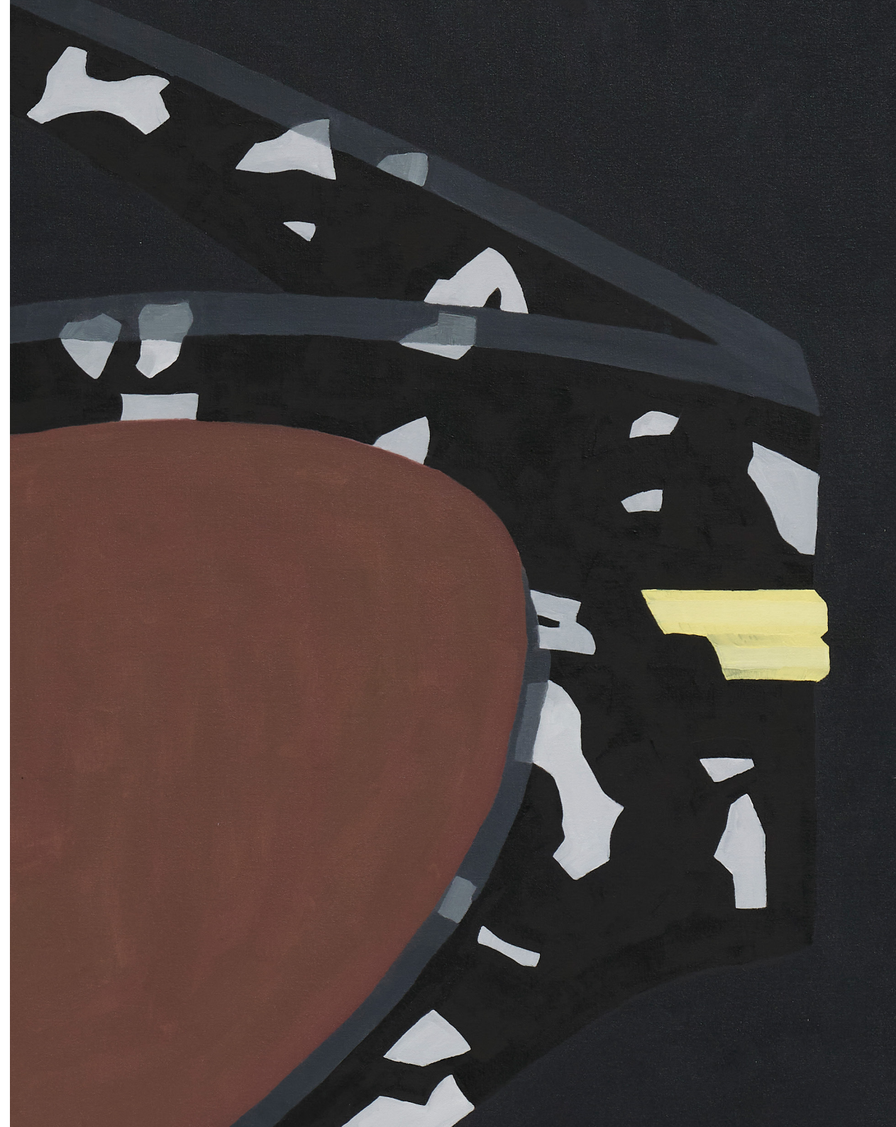
Schwarze Brille (detail), 2020