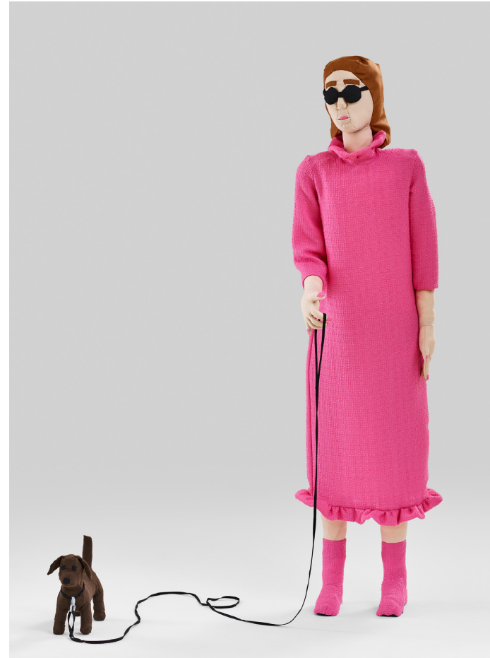
Figure 2 Raphaela Simon Rosa Frau , 2018 fabric, cotton wool, wooden construction, metal wire overall: dimensions variable woman figure: 190 x 60 x 54 cm.; 74 3/4 x 23 5/8 x 21 1/4 in. dog: 28 x 41 x 13 cm.; 11 x 16 1/8 x 5 1/8 in.