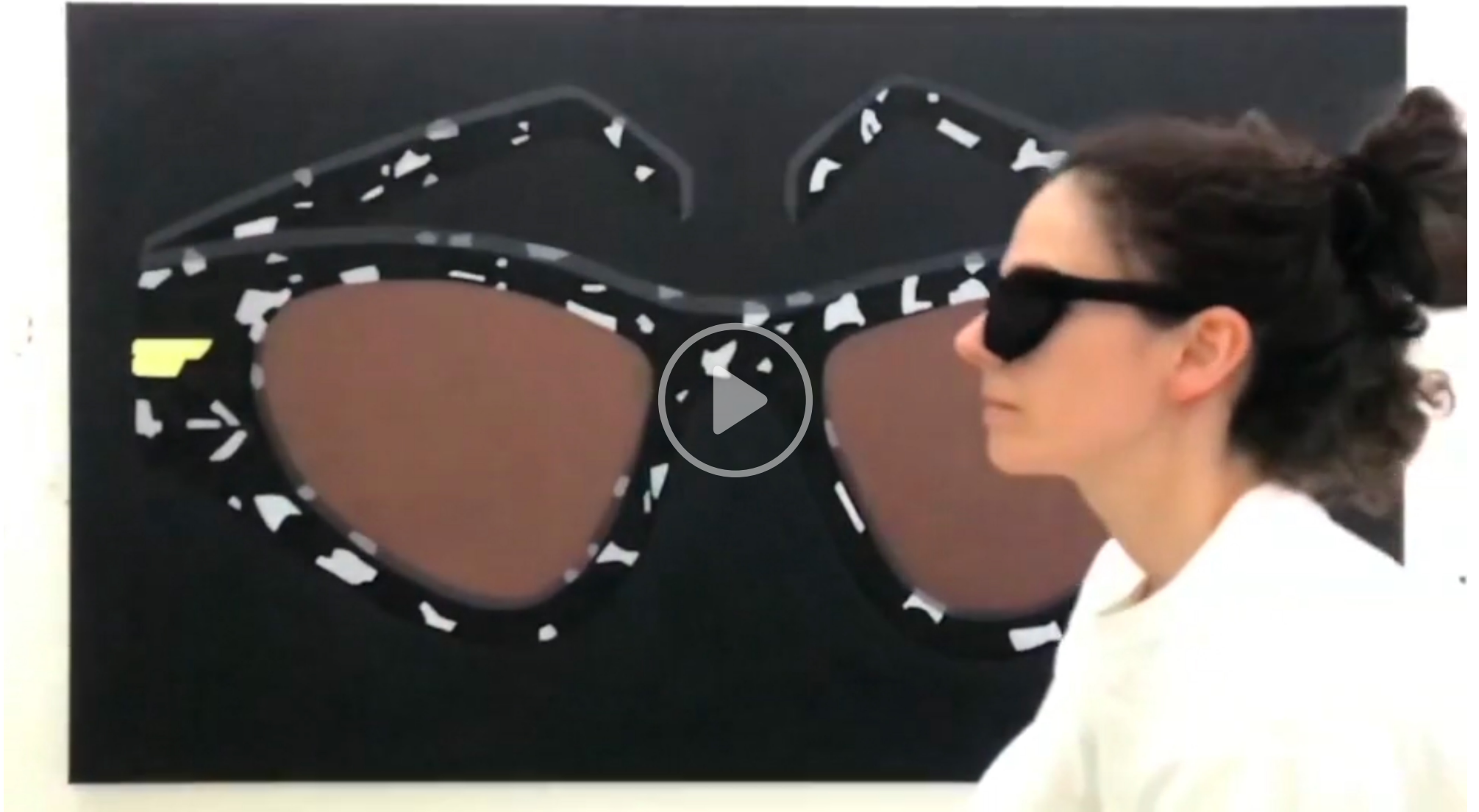
Schwarze Brille in the artist studio