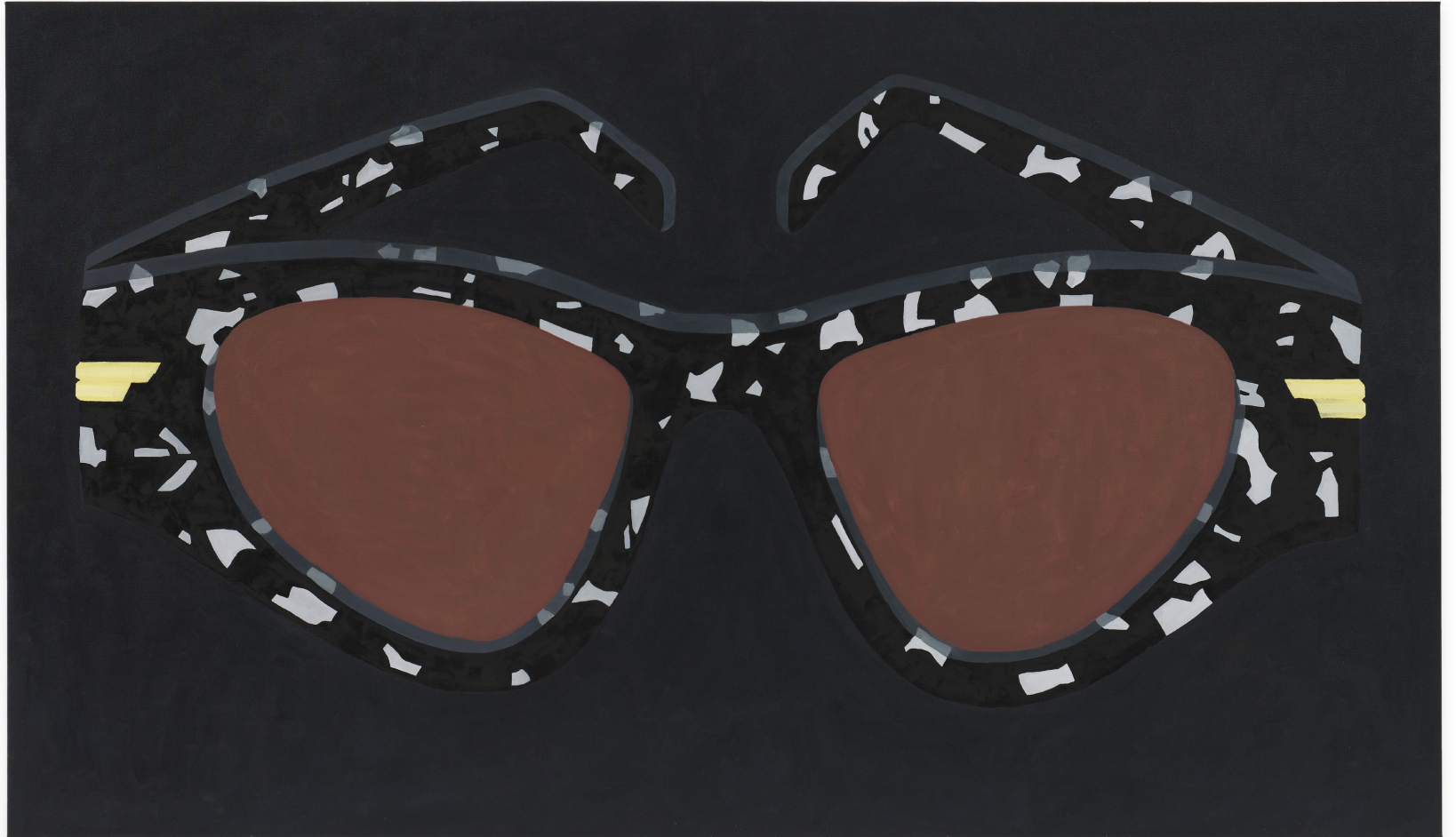
Raphaela Simon Schwarze Brille , 2020 oil on canvas 140 x 245 cm.; 55 1/8 x 96 1/2 in.