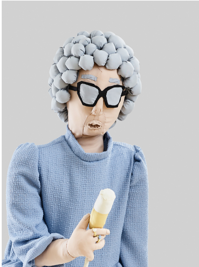
Figure 1 Raphaela Simon Hellblaue Frau (detail), 2018 fabric, cotton wool, wooden construction, metal wire 176 x 60 x 60 cm.; 69 1/4 x 23 5/8 x 23 5/8 in.