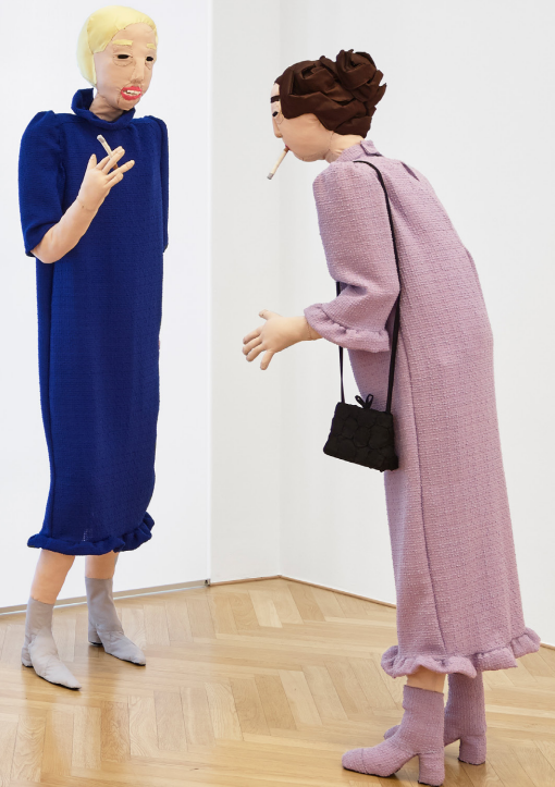
Sterne, Galerie Max Hetzler, Berlin, 2019