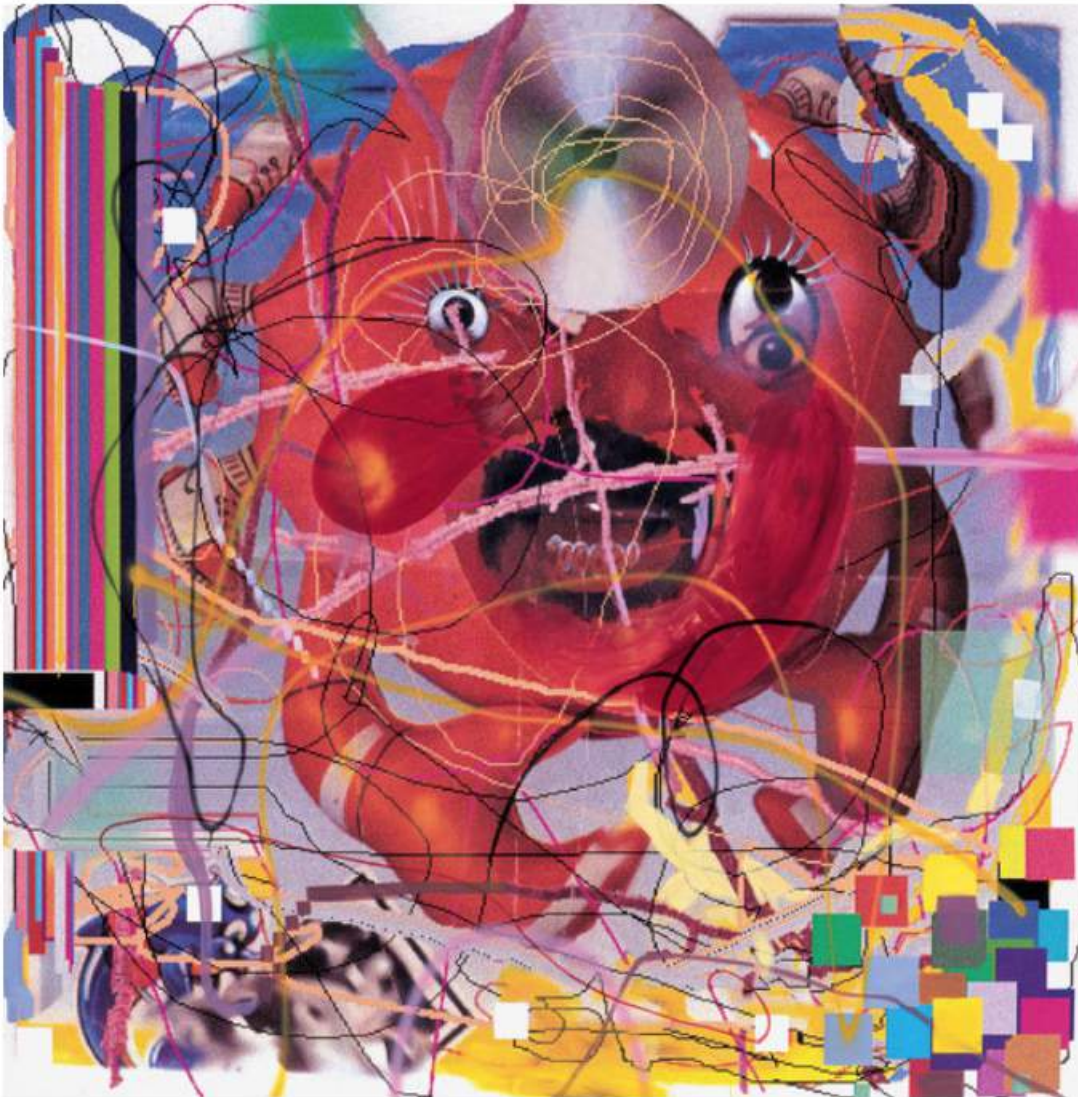
"Captain Jack" (1997), silk-screen and oil on canvas. His work conveys a sense of abandon and a variety of artistic influences.