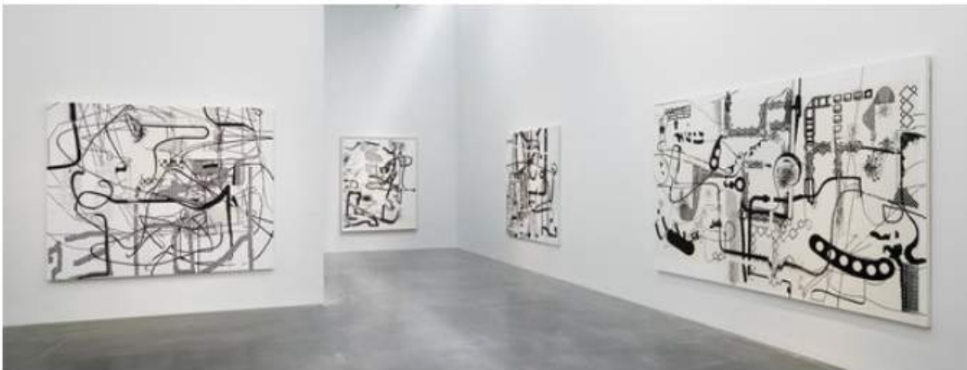
Works by Albert Oehlen at the New Museum: from left, “Untitled” (2008), “Der Vergiftete Asket” (“The Poisoned Ascetic”) from 1992, “Gripensis Posterior” (1997) and “Untitled” (2007).