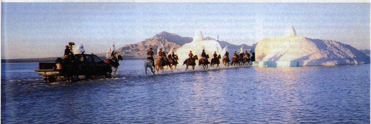
Barney had salt shipped to the Bonneville Salt Flats, top, so he could make a bullring out of it for "Cremaster 2." Below, filming the Evanston Cowboy Days Ladies Flag Posse as it enters the arena. The dots do get connected.