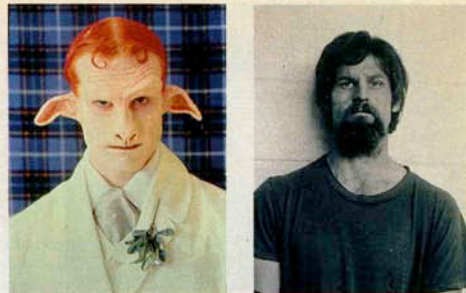
Barney as the Queen's Giant in "Cremaster 5," far left, and as the Loughton Candidate in "Cremaster 4," above left, and Gary Gilmore in "Cremaster 2." Given his mythological muse and his plan for a cycle of works, he has been called the Wagner of contemporary art.

'If a work is shown too many times, something gets stolen from it,' Barney says. 'You come to it with preconceptions, or you get tired of it.... So I try to protect myself and my work. I want there to be a fraction of the art that even I don't understand.'