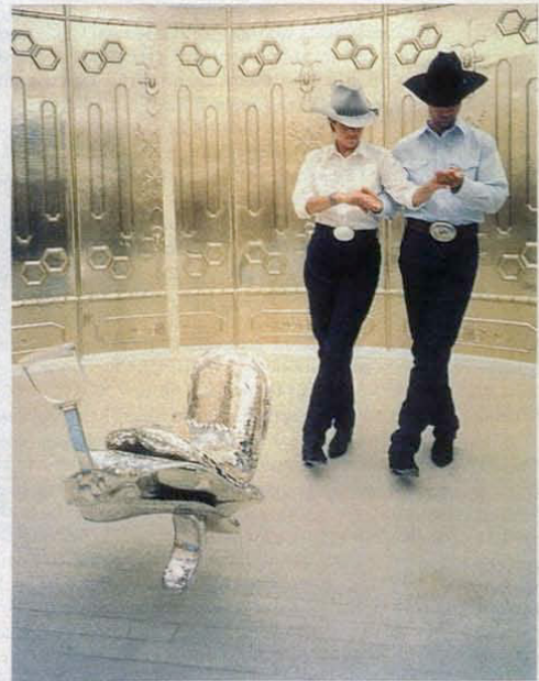
"Cremaster 2," which was shot as high-definition television and then transferred to 35-millimeter film, cost $1.7 million and is Barney's largest undertaking to date. More dots to connect: on the left, Gary Gilmore's first victim; on the right, dancing the two-step.