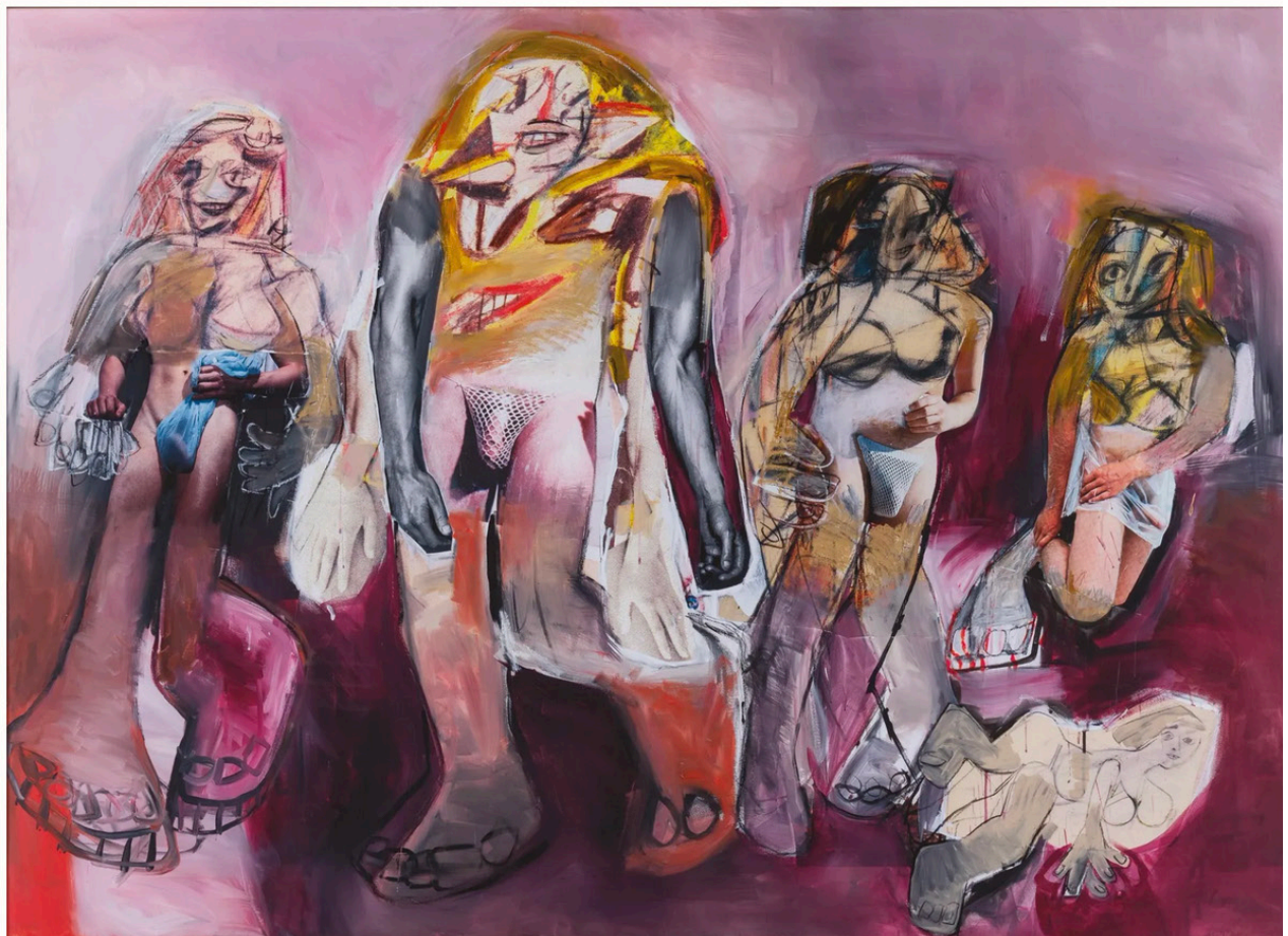
Untitled (de Kooning) (2008)

The American artist, who is showing works on paper at the Louisiana Museum of Modern Art in Denmark, discusses artistic inspirations and the history of his "rephotography" practice