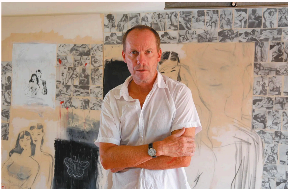
Richard Prince: “This could be only the second time my work has been shown with very little input from me”

Prince’s new exhibition Same Man at the Louisiana Museum in Humlebæk, Denmark, features 89 works, including 60 on paper, and is his first presentation in Denmark. He spoke to The Art Newspaper about the exhibition and his work, in an office at the museum with a roaring fire and windows looking out onto the sea—a scene that recalled a Danish design fever dream.