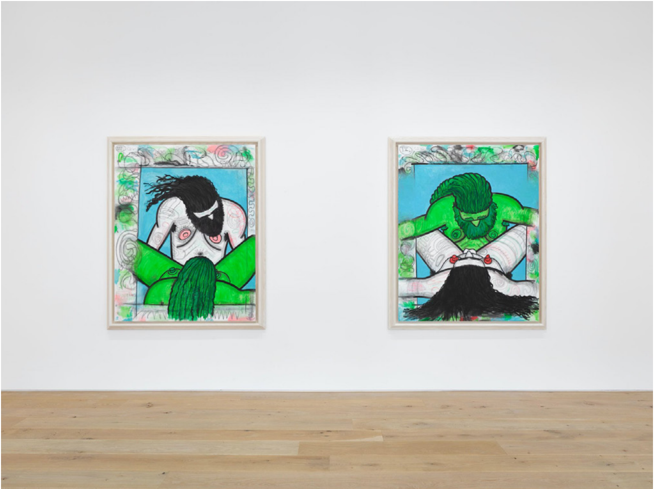
Carroll Dunham's Proof of Concept (III) (2020) and Proof of Concept (IV) (2020) at Galerie Max Hetzler, London