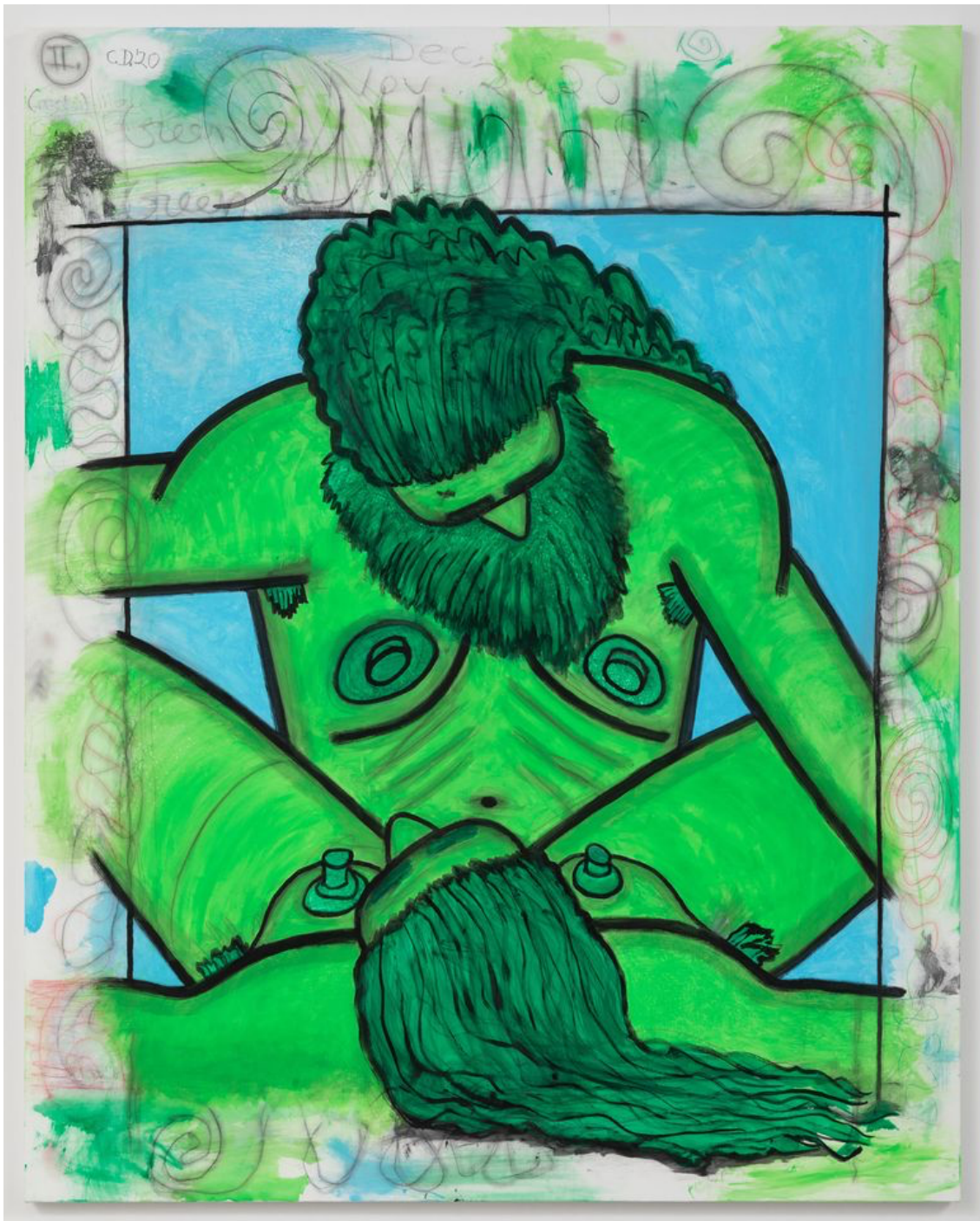
Carroll Dunham's Proof of Concept (II) (2020), part of a series that unites his male Wrestlers and female Bathers figures

Part of Dunham's project has always been to disregard the boundaries between high and low art. Early on, he was influenced as much by the underground comics scene of the 1960s and artists like Robert Crumb as he was by the art-historical canon. Those influences persist in the paintings on show at Galerie Max Hetzler, even if they are no longer at the forefront of