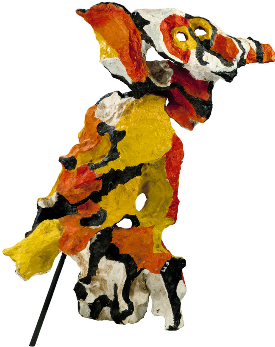
Karel Appel, The Owlman no. 1, 1960. Courtesy Musée d'Art moderne de la Ville de Paris © Karel Appel Foundation / ADAGP, Paris 2017

Whether they actually met remains a mystery, but Appel's solo exhibition at Annina Nosei Gallery did put him in the context of a hip, new art scene and brought his work to the attention of younger artists. Neo-Expressionism was the style of the moment and Appel was a master at pushing around paint.