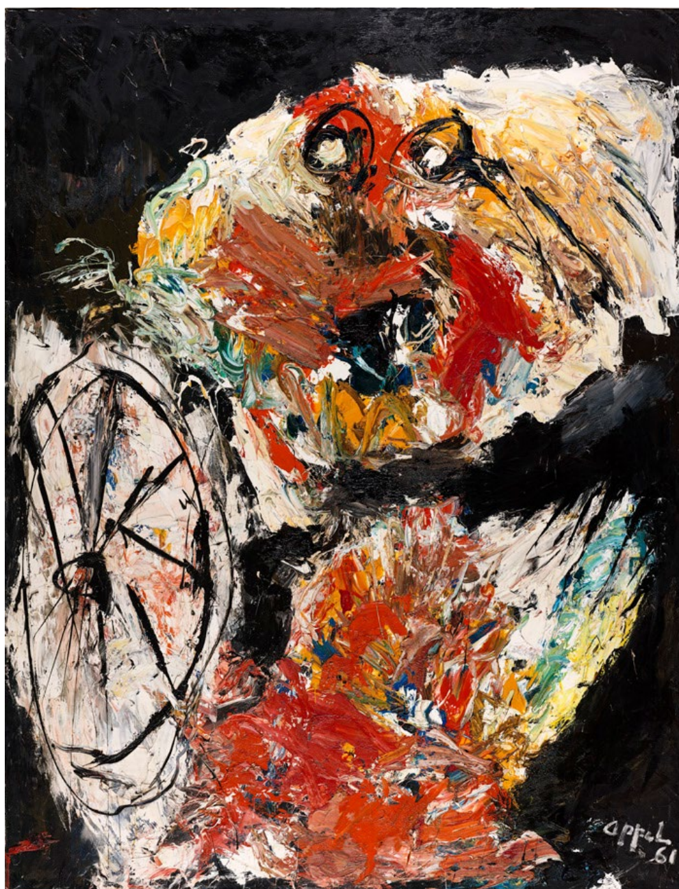
Karel Appel, Burning Child with Hoop, 1961.

As the 1960s progressed, Appel had a retrospective at the Stedelijk Museum Amsterdam and exhibited in documenta III in Kassel. Following the portraits, his work moved in the direction of standard Western art with the series of nudes and landscapes, although they were painted in his hard-hitting, painterly style.