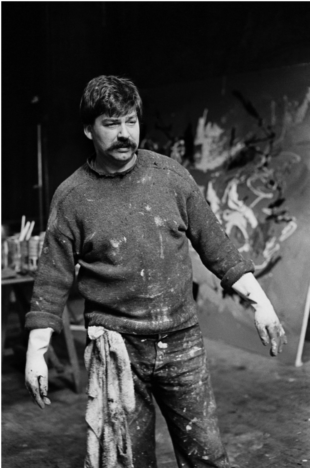
Ed van der Elsken, Still photo of Karel Appel from the film by Jan Vrijman, The Reality of Karel Appel, 1961

The subject of a talk at the Outsider Art Fair in Paris ( http://www.outsiderartfair.com/fair/2139 ) this month, Appel is one of the most celebrated Dutch artists—along with Piet Mondrian and Willem de Kooning—of the 20 th century. Making his first artworks while still a teenager, Appel entered the Rijksakademie in Amsterdam in 1942, but his education was cut short when he was forced to go into hiding from the Nazis.