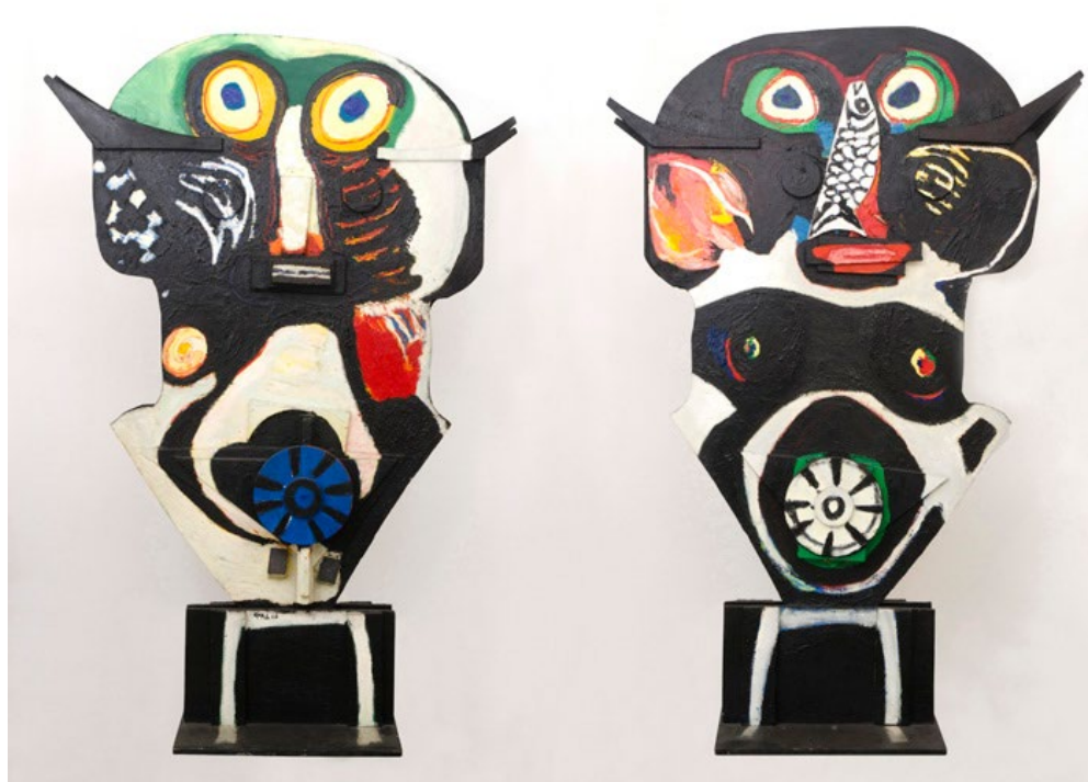
Karel Appel, The Black Madonna, 1966.