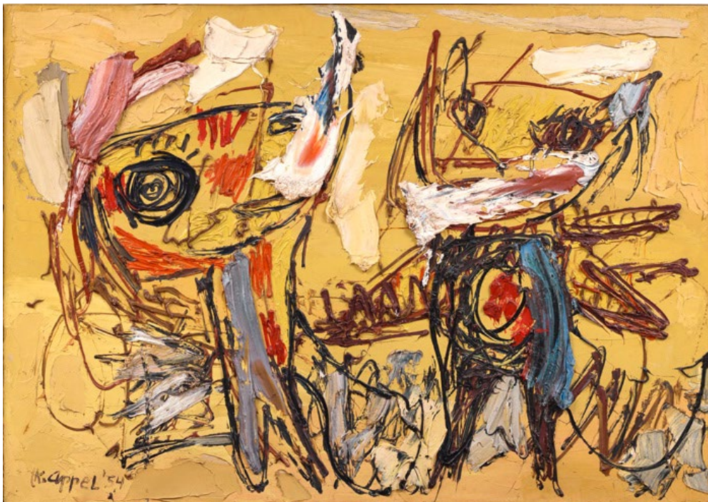
Karel Appel, The Desert Dancers, 1954.

Named for the initials of the members' home cities: Co (Copenhagen), Br (Brussels) and A (Amsterdam), CoBrA was formed in 1948 by Appel, Constant, Corneille, Christian Dotremont, Asger Jorn and Joseph Noiret at the Café Notre-Dame in Paris. Complete with a manifesto, the leftist group rejected Western aesthetics and embraced spontaneity and collaborative working methods, while drawing inspiration from children's drawings, primitive art and the art of the insane.