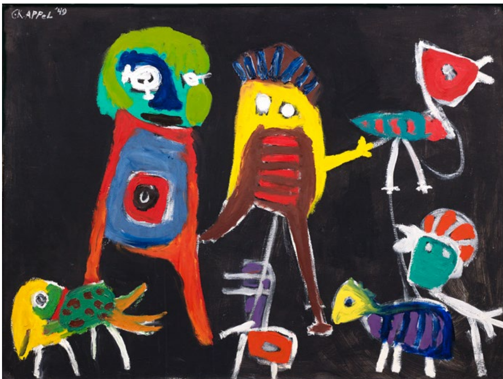
Karel Appel, Little Hip Hip Hourra , 1949. Courtesy Musée d'Art moderne de la Ville de Paris © Karel Appel Foundation / ADAGP, Paris 2017