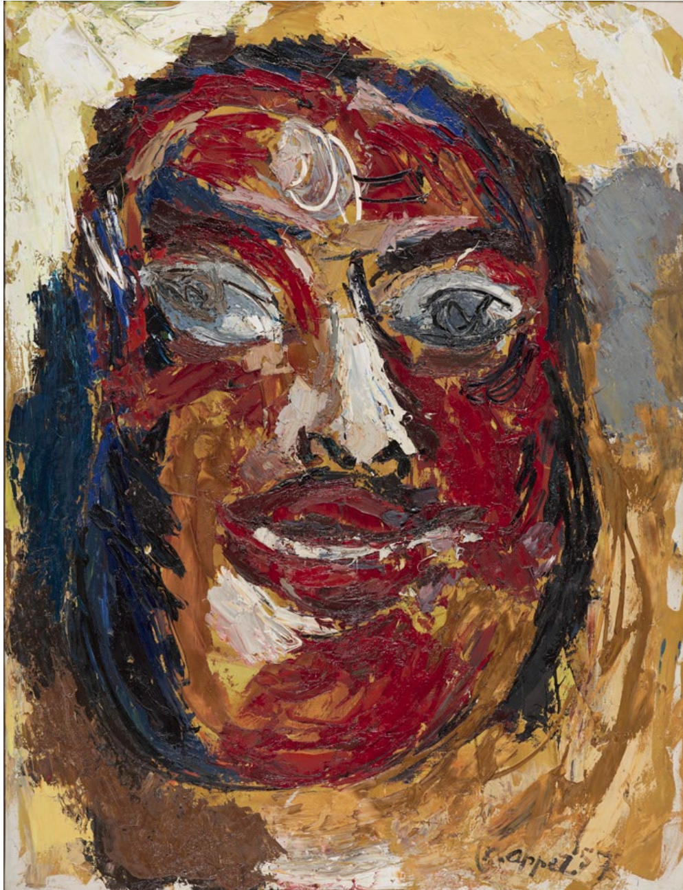
Karel Appel, Portrait of Count Basie, 1957.

Visiting New York for the first time in 1957, Appel befriended the Abstract Expressionist painters Franz Kline and Willem de Kooning while summering on Long Island and painted portraits of jazz musicians Count Basie and Sarah Vaughn in Sam Francis' studio. Seeing de Kooning's Woman series in the flesh would prove influential to Appel's nudes, which he painted a few years later.