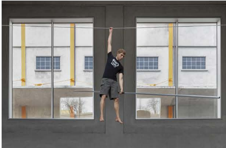
Elmgreen & Dragset's What's Left? (2021) in the exhibition "Useless Bodies?" by Elmgreen & Dragset at Fondazione Prada, Milan.