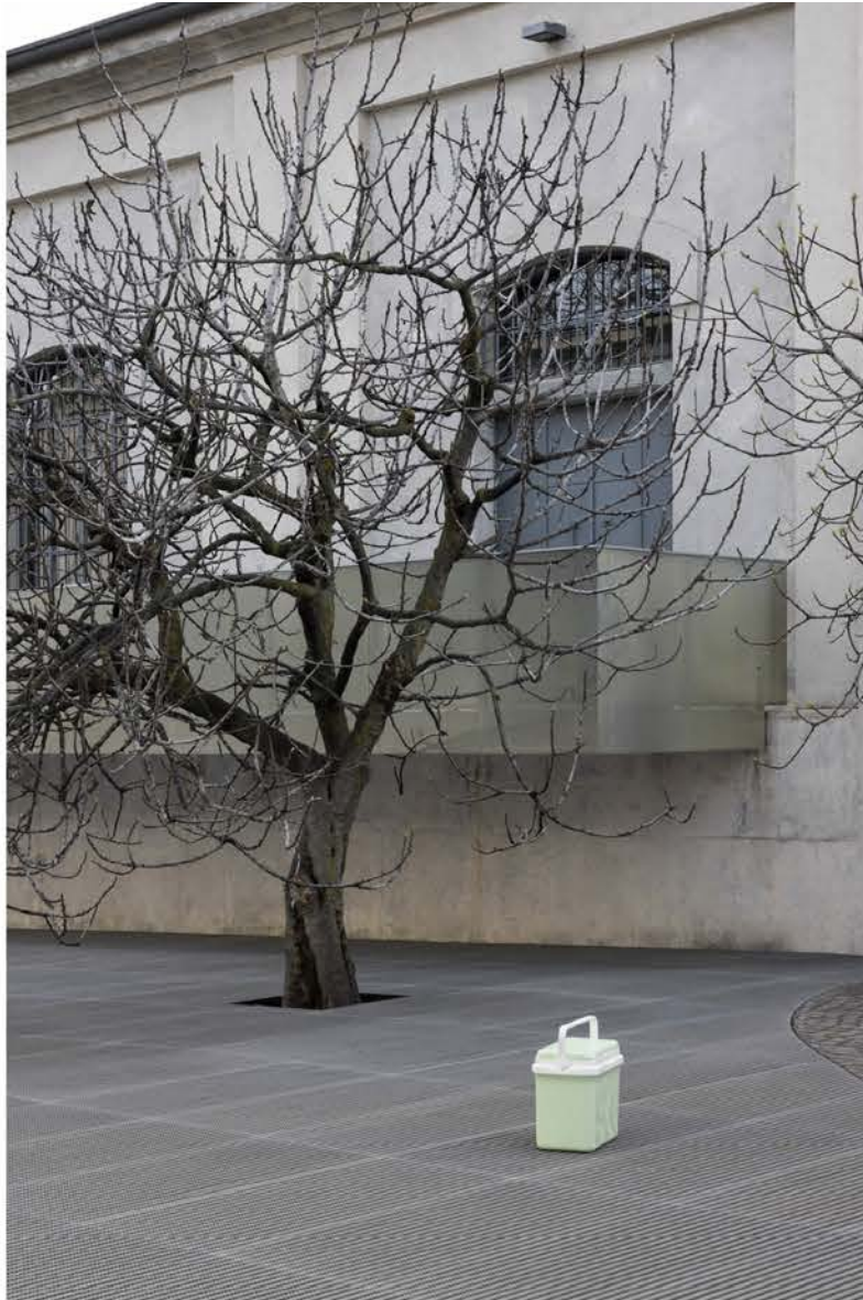
Exhibition view "Useless Bodies?" by Elmgreen & Dragset at Fondazione Prada, Milan.