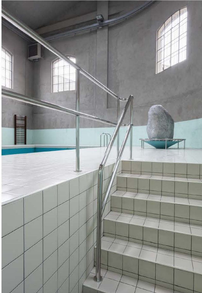
Exhibition view "Useless Bodies?" by Elmgreen & Dragset at Fondazione Prada, Milan.