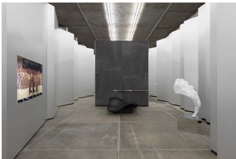
Exhibition view "Useless Bodies?" by Elmgreen & Dragset at Fondazione Prada, Milan.