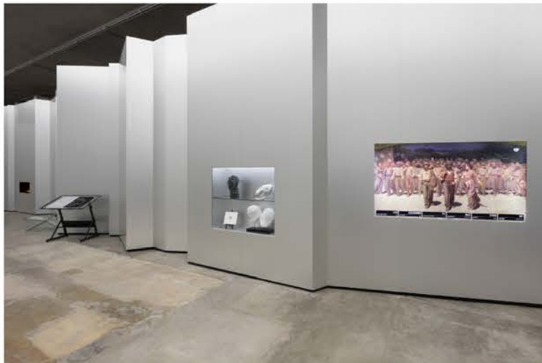
Exhibition view "Useless Bodies?" by Elmgreen & Dragset at Fondazione Prada, Milan.