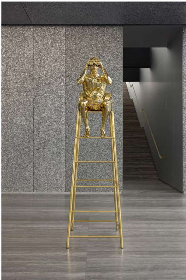
Elmgreen & Dragset's Watching (2021) in the exhibition "Useless Bodies?" by Elmgreen & Dragset at Fondazione Prada, Milan.