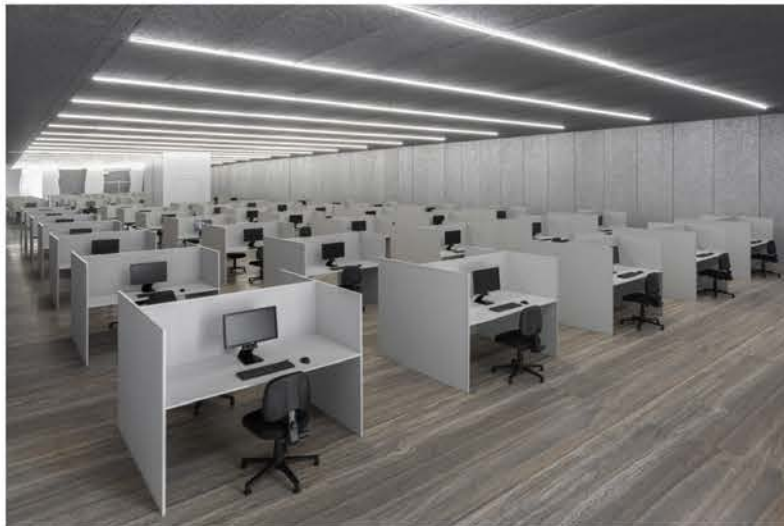
Exhibition view "Useless Bodies?" by Elmgreen & Dragset at Fondazione Prada, Milan.

"Elmgreen & Dragset: Useless Bodies?" is on view through August 22, 2022.