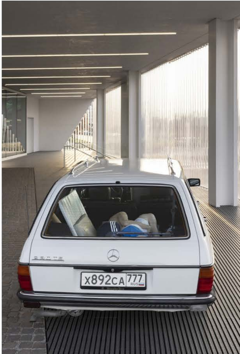
Exhibition view "Useless Bodies?" by Elmgreen & Dragset at Fondazione Prada, Milan.