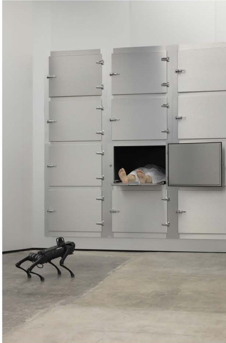
Exhibition view "Useless Bodies?" by Elmgreen & Dragset at Fondazione Prada, Milan.