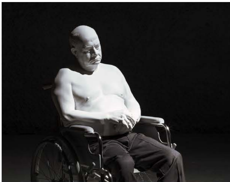
Elmgreen & Dragset, Bogdan (2020).