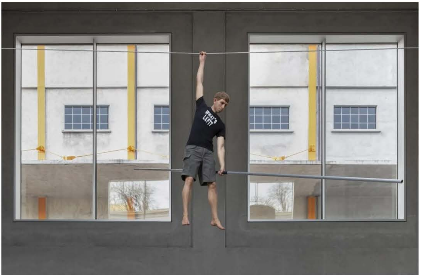
Elmgreen & Dragset's What's Left? (2021) in the exhibition "Useless Bodies?" by Elmgreen & Dragset at Fondazione Prada, Milan.

The show is on view now at the Fondazione Prada in Milan.