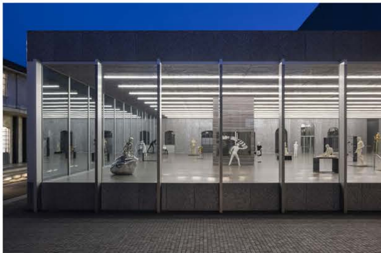
Exhibition view "Useless Bodies?" by Elmgreen & Dragset at Fondazione Prada, Milan.