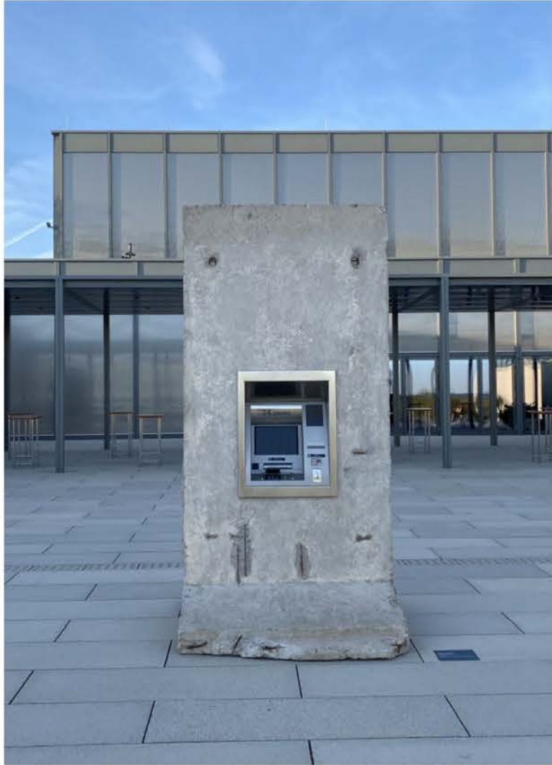
Elmgreen & Dragset, Statue of Liberty, Fig. 2 (2021). Installation view, 14th Robert Jacobsen Prize of the Würth Foundation, Museum Würth 2, Künzelsau, Germany, 2021.