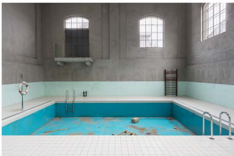
Elmgreen & Dragset's Piscina di Largo Iscaro (2021) in the exhibition "Useless Bodies?" by Elmgreen & Dragset at Fondazione Prada, Milan.