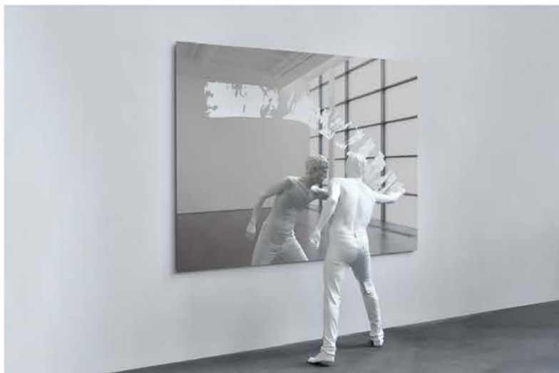
Elmgreen & Dragset, The Painter, Fig. 2 (2021).