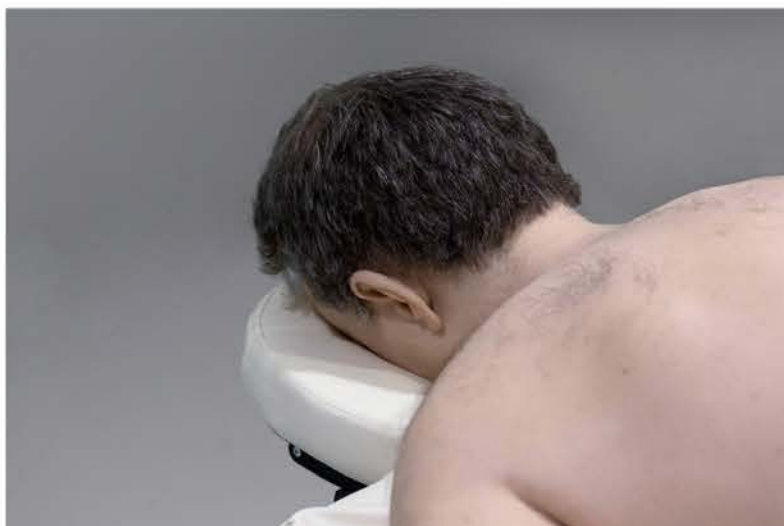
Elmgreen & Dragset, The Touch (2011).