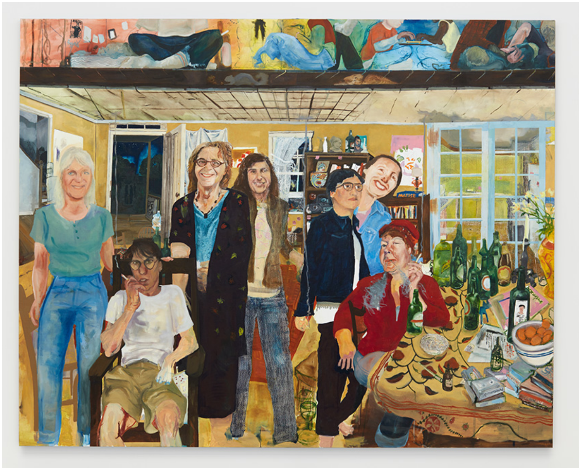
Celeste Dupuy-Spencer, Dutchess County Border (Matriarchs of the 90's Line) (2018). Oil on linen, 96 x 120 in.