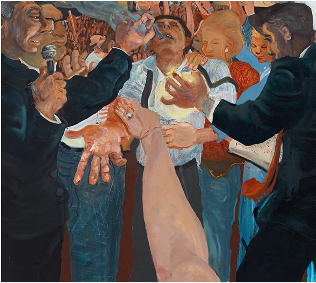
Celeste Dupuy-Spencer, Through the Laying of the Hands (Positively Demonic Dynamism) (2018). Oil on linen, 48 × 40 inches. Image courtesy of the artist and Nino Mier Gallery.

Resurgences in figurative painting have accompanied turns to the political right before. Sometimes by force (when regimes deem experiment a threat), but other times just in response to, or in an attempt to grapple with, the zeitgeist. Eric Fischl, David Salle, and Robert Longo's ascendancy coincided with Reagan's. The painters poked at times at whiteness, even as white people celebrated and supported them (think Fischl's painting A Visit to/A Visit From/The Island , 1983, of white vacationers cavorting while black islanders rescue black refugees from waves of a storm). Jeffrey Deitch, dealer and former MOCA Los Angeles director, explained two years ago that figuration was of the zeitgeist again. "That's really what most artists do," he told ArtSpace, right after he'd put both '80s phenom Julian Schnabel and the much younger Sasha Brauning in the same show, "and what the general public generally expects out of painting. They relate to it." He then further peddled the myth of populist art form ignored by the establishment, saying, "there's hardly been an ambitious exhibition of new figurative painting in any American museum in a long time." 7 (He isn't entirely wrong, if he means group surveys.) His words echo past critics who framed figurative resurgences as repudiations of the avant-garde, returns to more traditional and thus comprehensible ways of representing life.