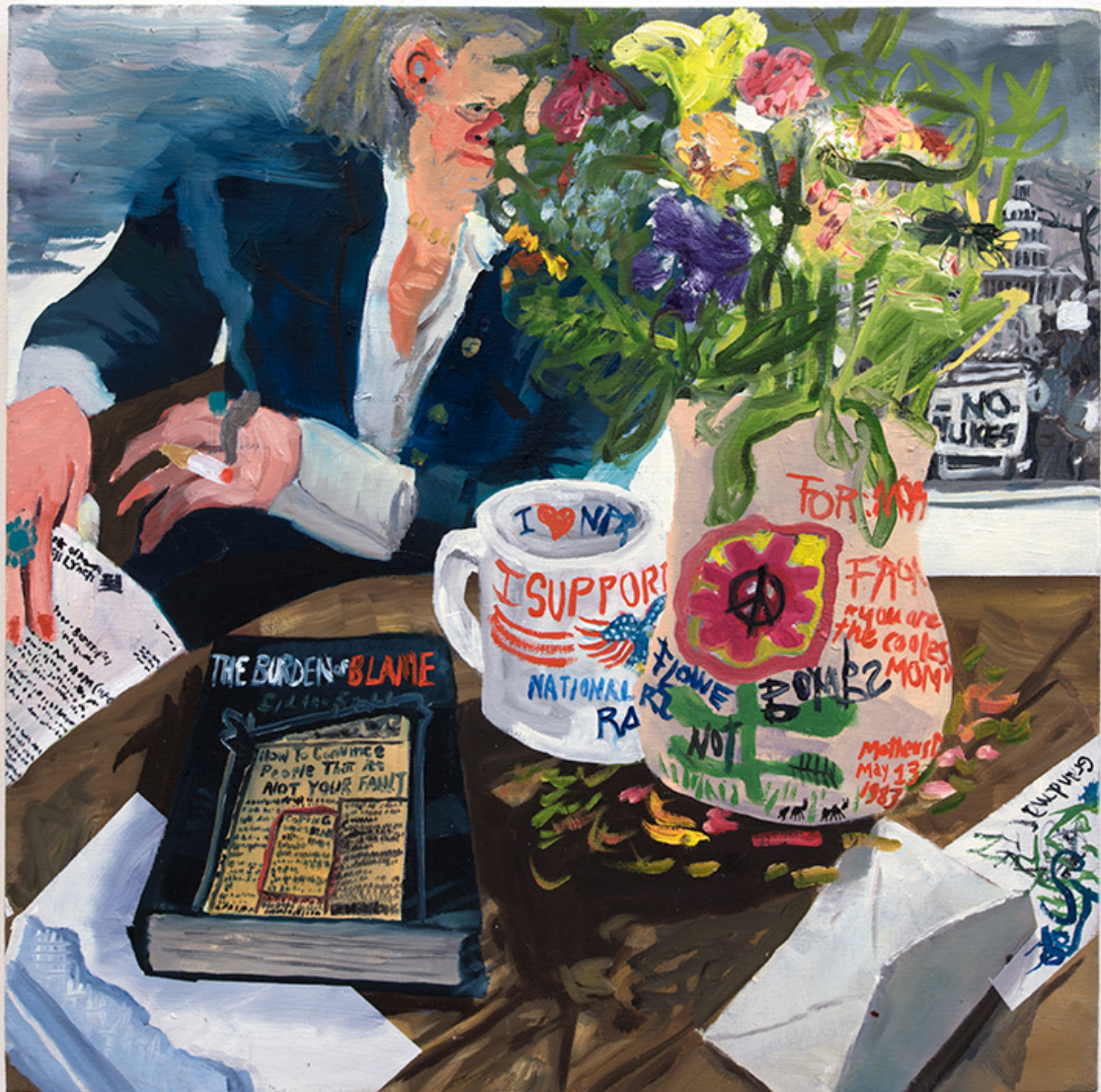
Celeste Dupuy-Spencer, Love Me, Love Me, Love Me, I'm a Liberal (2017). Oil on canvas, 20 × 20 inches.