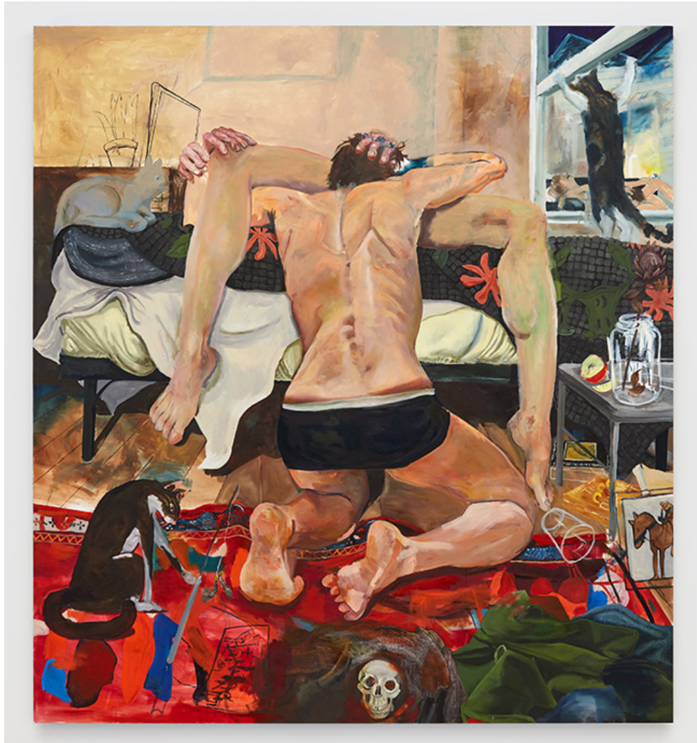
Celeste Dupuy-Spencer, The Chiefest of Ten Thousand (Sarah 2) (2018). Oil on linen, 105 × 96 inches.