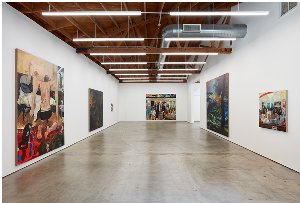
Celeste Dupuy-Spencer, The Chiefest of Ten Thousand (2018) (installation view).