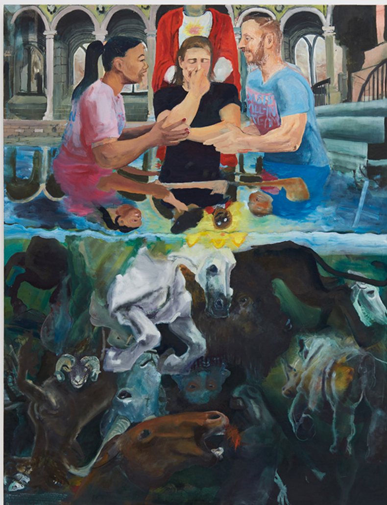
Celeste Dupuy-Spencer, Darkness Is Not Dark (Light Shines As Day) (2018). Oil on linen, 65 × 50 inches.