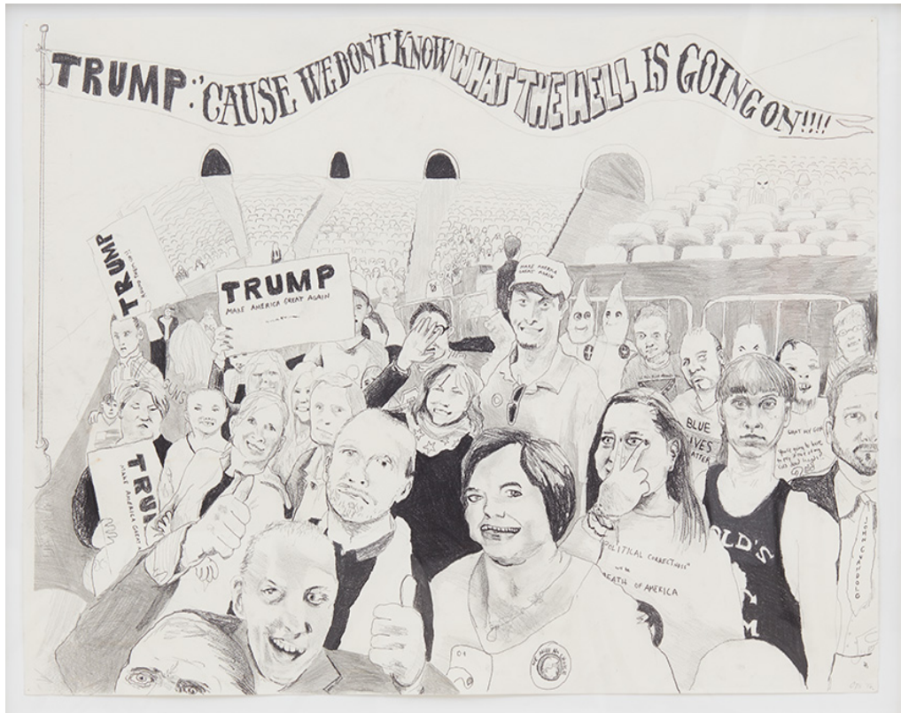
Celeste Dupuy-Spencer, Trump Rally (And Some of them I Assume Are Good People) (2016). Pencil on paper, 24 x 30 inches.