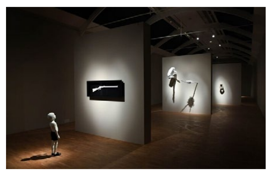
Elmgreen & Dragset: This Is How We Bite Our Tongue, at the Whitechapel Gallery

The male journey from boy to man, a favourite theme already seen in the pair's work for Trafalgar Square's Fourth Plinth – a giant golden boy on a rocking horse – is explored in a series of creepy tableaux with blank, white figures in what looks like plaster, but is actually, yes, painted bronze.