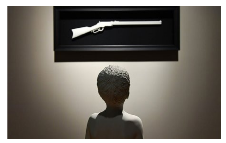
Elmgreen & Dragset: This Is How We Bite Our Tongue, at the Whitechapel Gallery

The theme of gay love and commitment is extended in Powerless Structures: simply two pairs of matching Clavin Klein underpants and Levi jeans, left in one of the upper corridors as though just taken off. Mundane, discarded objects have become a commonplace in contemporary art, with the invariable conceit that they're rendered in extremely expensive painted bronze. The conceit here is that they actually are pants and jeans, which is almost refreshing.