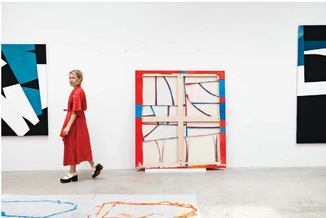
The Brooklyn-based artist amid a sampling of her vibrant, sewed-together canvases.