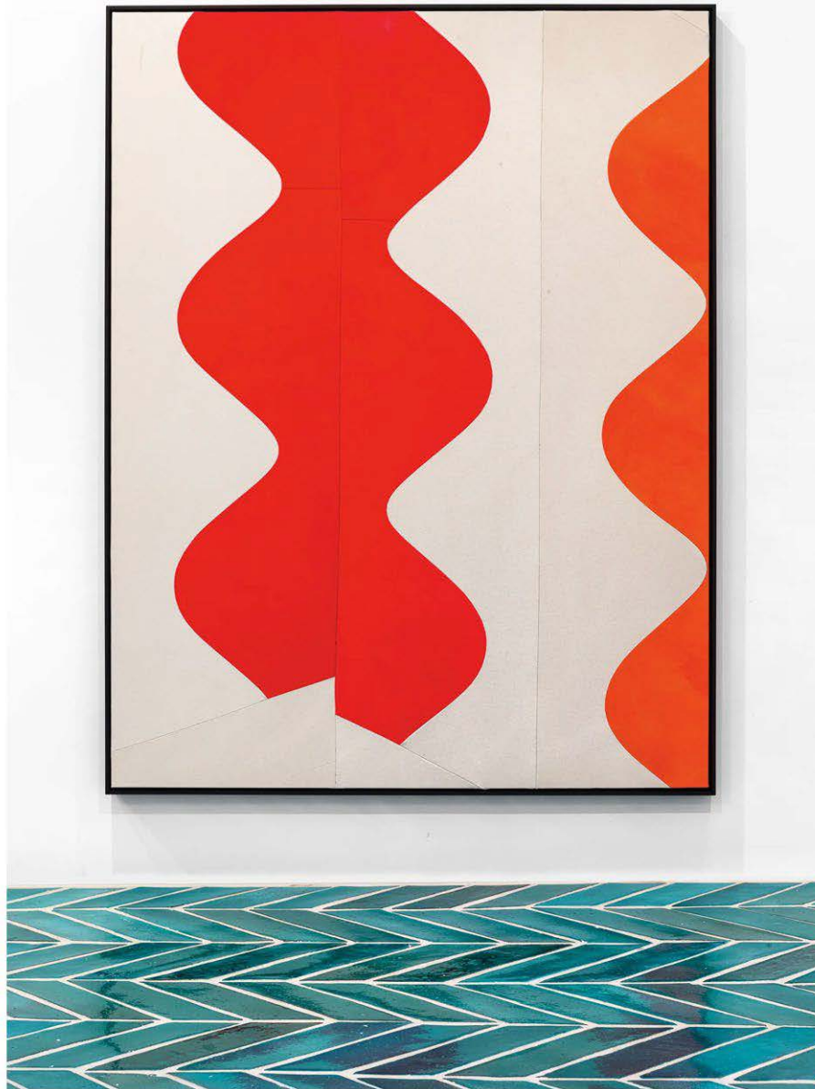
The Wave (Urszula) , 2014. The Wave (Urszula) , 2014. Acrylic on canvas and raw canvas, sewn. 60" x 78". © Sarah Crowner. Courtesy of the artist and Casey Kaplan, New York.