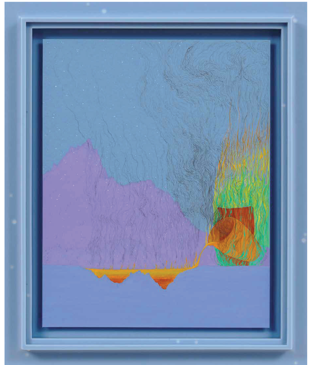
BLIFE NOCTURNE, 2021 Graphic and gouache on paper in high-density polystyrene frame 44 x 37 x 3 cm

Instead of proving a thesis or generating universally valid solutions, Matthew Barney creates complex connections that entangle everything—people, landscapes, power relations. And, indeed, he deliberately doesn't try to untangle them. Colonialism means that one system of knowledge overturns and displaces another. In Redoubt , there is no such duality between researcher and subject. Everybody in the zone becomes a player and is transformed by their engagement, so that one knowledge system does not dominate another, does not transform into mere tradition or folklore. Redoubt can be read as a portrait of the divided American society in the Trump era. But you can also take it as an invitation to look for other materialist or alchemical forms of experience and knowledge, to engage with the legacy of our ancestors, be they Native myth or colonial ideology. Not to come to terms with our past, but perhaps to save our future. In Haraway's words, we have to remember that “the sky has not fallen—yet.”