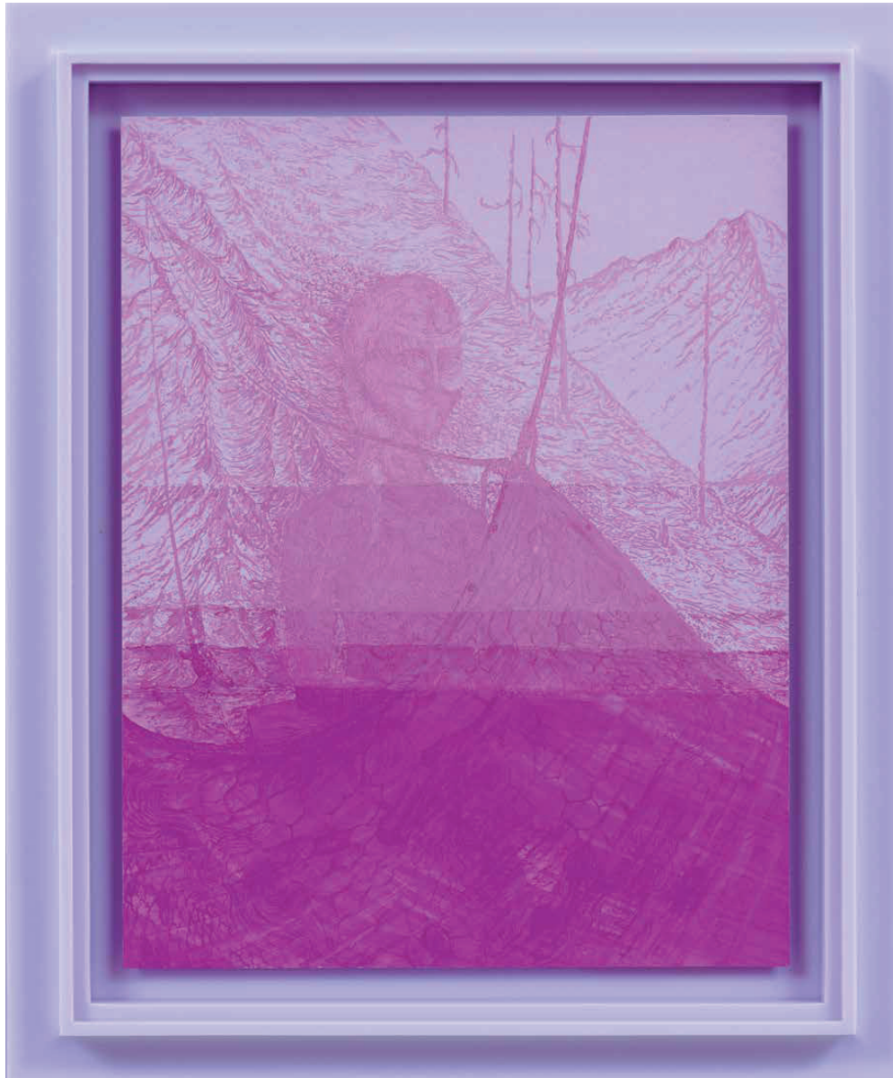
VIOLET DIANA, 2021 Gouache on paper in high-density polyethylene frame 44 x 37 x 3 cm