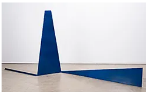
'Slow Movement', 1965

Tate's "Déjeuner sur l'herbe", a bold sprawl of steel whose gloopy, unruly folds mock the mannered drama of Manet's masterpiece, is surely an escapee from YSP's show. The title of "Morning Shadows" (2012) — a precarious encounter between steel slabs and tubes — nudges us to imagine light and darkness as solid matter in a way that recalls the efforts of abstractionists such as Pierre Soulages. A late masterpiece, "Terminus" (2013), shows Caro at his experimental, Expressionist best, criss-crossing frosted raspberry planks of his favourite new material, Perspex, with steel girders and lengths of wood spattered with claret paint.