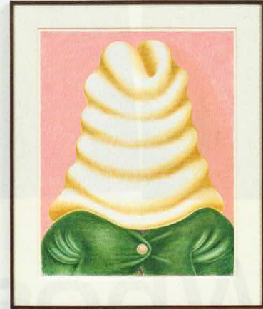
Untitled, 2018, coloured pencil on paper, 60.8 x 48.2 cm

truncated body is now just gargantuan feet running into knotty, oversized nipples, spurting milk like a two-pronged ornamental fountain. Exaggerated and scrambled up, Bonnet's bodies show us the powerful absurdity that is always there, even when covered up or obscured. As she says, "Cary Grant is encased in a perfectly cut three-piece Prince de Galles suit, but you have to remember that there are hairy testicles in there swaying on their own."