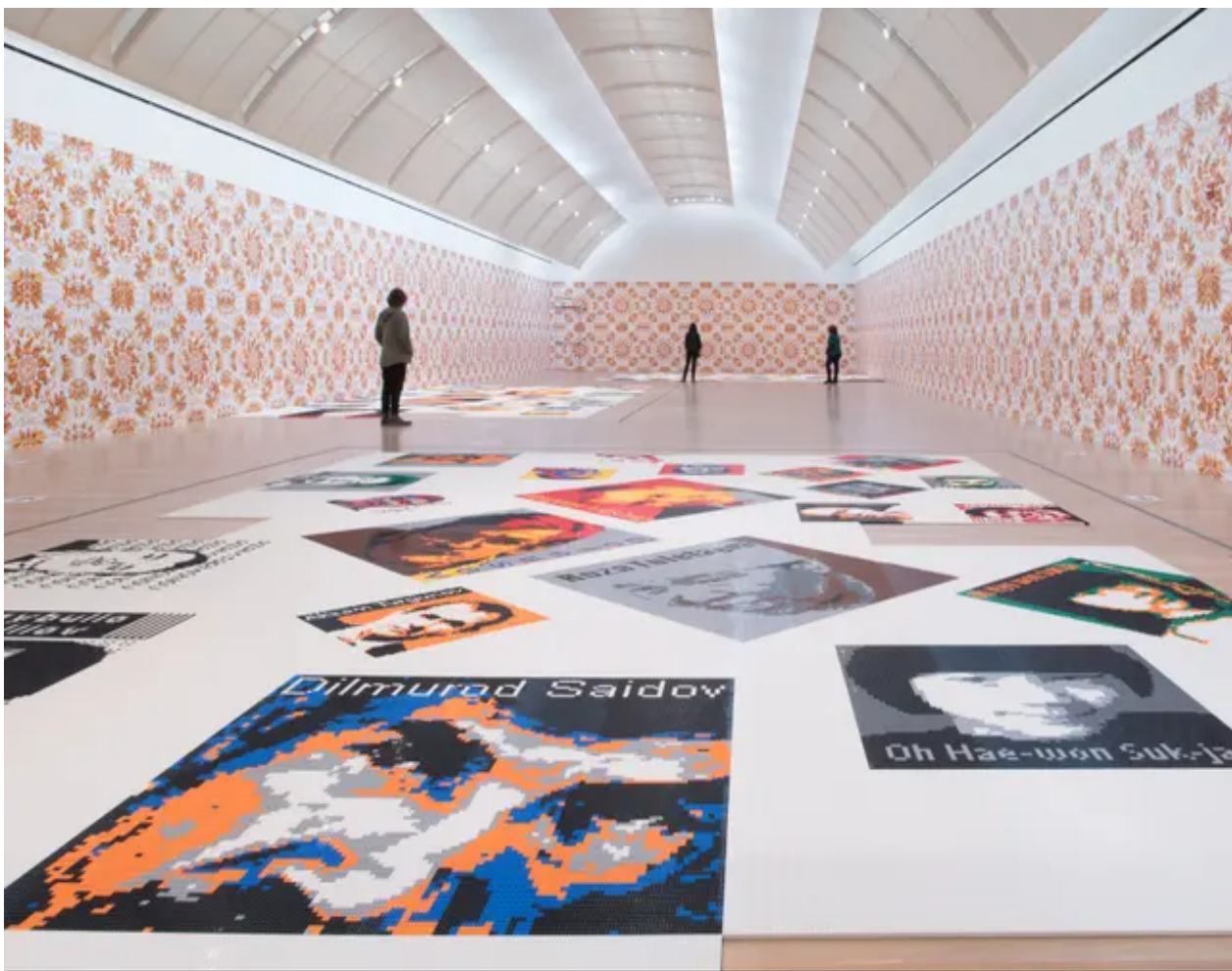
Ai Weiwei's Trace

He says this with a wry smile, but it's true that China's many attempts to silence Ai have only served to amplify his voice. He released Coronation himself online, while galleries around the world still clamour to display his work. His exhibition Trace , which opens today at Los Angeles' Skirball Cultural Centre, features his wallpaper installation The Animal That Looks Like a Llama but Is Really an Alpaca . Its pattern is made up from the iconography of surveillance – handcuffs and CCTV cameras – along with tiny alpacas, a mascot of freedom of expression in Chinese internet culture.