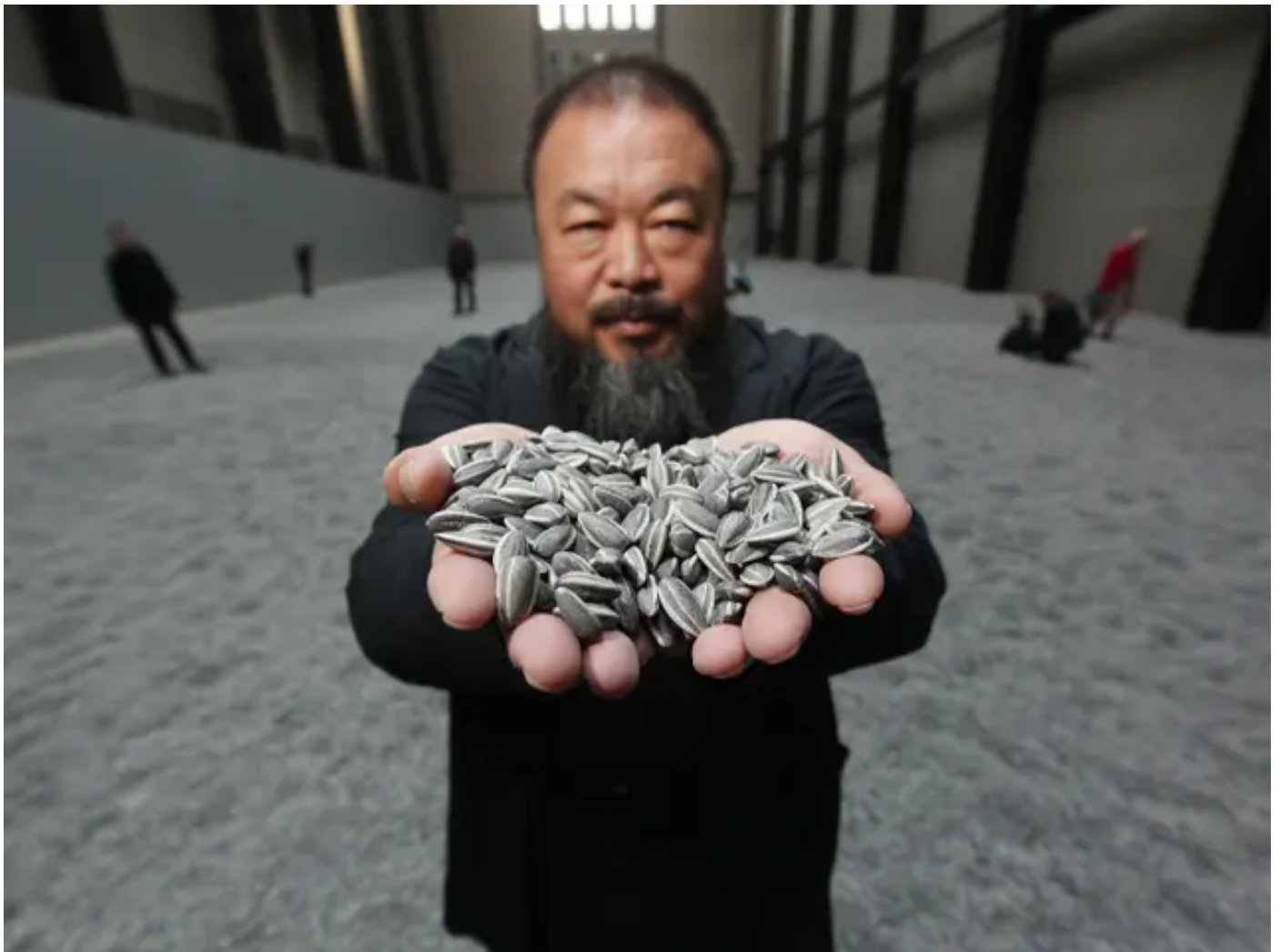
Ai Weiwei holds some seeds from his Unilever installation Sunflower Seeds at Tate Modern, October 2010

He laughs off my suggestion that his decision to leave Britain might have had anything to do with Boris Johnson's mishandling of the coronavirus pandemic. "I don't pay much attention to those political figures," he says. "Somehow I realised that there's only one political figure, and that's the one in power. If they're not in power, they disappear. When they're in power, somehow they all have the same kind of character. It's very hard to find someone in power who is interesting, humorous, intelligent, ambitious and can be convincing – so no, I didn't pay much attention to him."